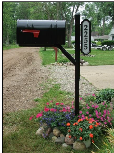
Black Border Address Sign